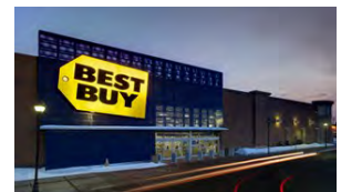
Best Buy Stores Coverage for CDMA & LTE 35 stores across multiple states