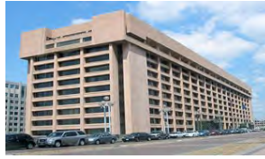
USPS HQ - Washington, DC USPS HQ office ~750,000 sqft