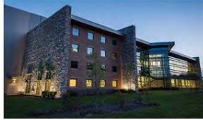
Howard County Government Multiple buildings across Howard County, MD ~400,000 sqft