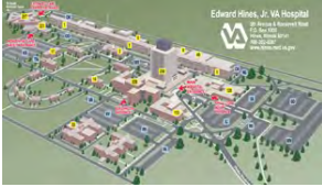
VA Medical Center - Chicago IL Historical VA hospital campus ~2,500,000 sqft