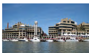
Kelley, Drye & Warren LLP Prestigious Georgetown Law Firm ~350,000 sqft