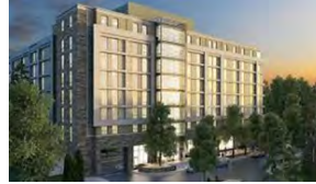
American University - North Hall Modern 8 story student housing ~110,000 sqft