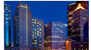
Westin - Pittsburgh, PA Office and hotel tower ~500,000 sqft