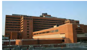
VA Medical Center - Durham, NC 12 story medical facility ~700,000 sqft