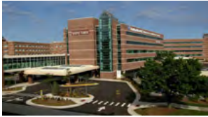
Winchester Medical Center - VA Campus DAS with 3,000,000 visitors/year ~1,600,000 sqft