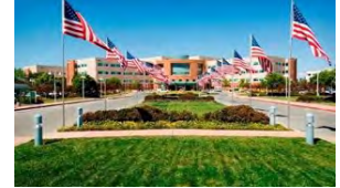
VA Medical Center 8 building hospital campus ~900,000 sqft