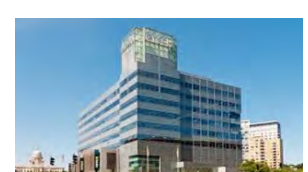
GTech - Providence, RI Corporate offices ~400,000 sqft