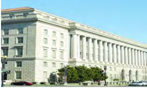
IRS - Washington, DC IRS office building in the heart of DC ~1,000,000 sqft