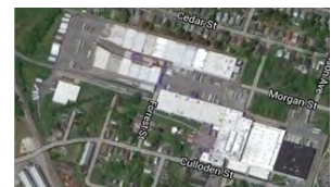
Kraft Foods - Suffolk, VA Food manufacturing facility ~1,000,000 sqft