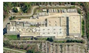
Kellogg - Cary, NC Food processing plant ~800,000 sqft