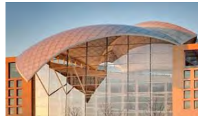
KIPP Schools - DC & MD 5 Schools located across MD & DC ~600,000 sqft