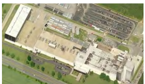
Kraft Foods - Richmond, VA Bakery & productions facility ~900,000 sqft