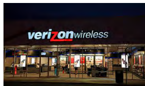
Verizon Stores - MD/DC/VA Coverage for CDMA & LTE 35 stores across multiple states