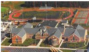
Southern Regional Schools High school, middle school & elementary school ~400,000 sqft