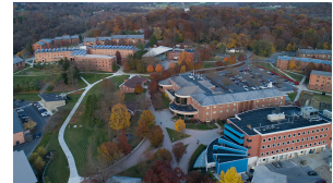
Messiah University Campus DAS ~420,000 sqft