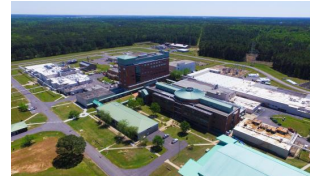
FDA NCTR - Jefferson, AR Campus DAS ~1,400,000 sqft