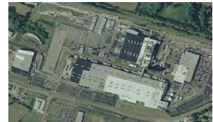
Daimler Campus Truck manufacturing facility ~1,000,000 sqft