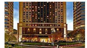
Marriott Ritz-Carlton, VA 10 story hotel & meeting rooms ~250,000 sqft