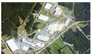
Fujifilm Campus - Greenwood, SC 11 Bldg manufacturing campus ~3,500,000 sqft