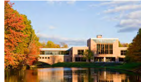
Dolce - Palisades, NY Hotel & training center ~600,000 sqft