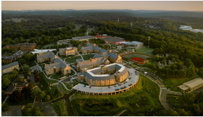
Sacred Heart University Campus DAS ~1,200,000 sqft