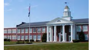
Loudoun County Schools 15 schools in northern VA ~1,200,000 sqft