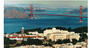
VA Medical Center - CA 7 building campus ~600,000 sqft