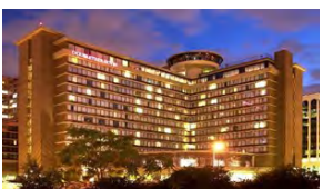
Doubletree—Arlington, VA 15 story hotel & conference center ~200,000 sqft