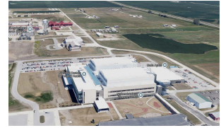
USDA NCAH - Ames, IA Campus DAS ~1,000,000 sqft