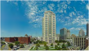
Thomas F. Eagleton Courthouse Federal courthouse ~1,350,000 sqft