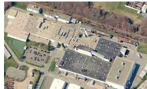
Nestle - Middleboro, MA Nestle Ocean Spray beverage plant ~660,000 sqft