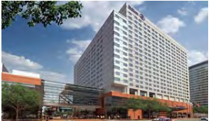
Hilton - Baltimore, MD 4 star hotel & conference center ~800,000 sqft