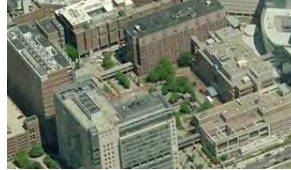
PENN Hospital Historical university hospital campus ~800,000 sqft